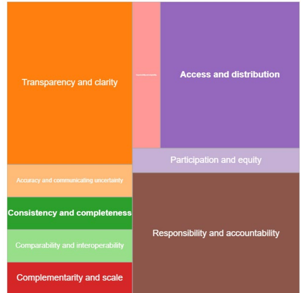
Weights of TM-Elements in Côte d'Ivoire